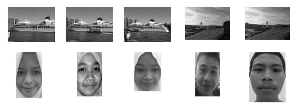
Figure 5. Sample images from scene and landscape (first row), and student facial (second row) datasets

Two small image datasets were used in experiments, scene and landscape pictures, and vocational school student face images while they were on the job training in the Faculty of Electronic and Computer Engineering, UKSW. Sample images from both datasets are displayed in Fig. 5. There are 10 classes in the scene and landscape datasets, such as cruiser ship, lighthouse, kids playground, and campus library. Each class consists of two or more images from different scenes and point of views. Total number of detected keypoints is 6843. There are 9 classes in the student facial datasets, with all girls wearing hijab and either little bit looked to the left, right, or down for approximately at 5-10 degrees. Each class consists of three images with different pose. Total number of detected keypoints is 1079. The experiment results are presented in Table 1 and Table 2, in the scene and landscape datasets and student facial datasets, respectively.