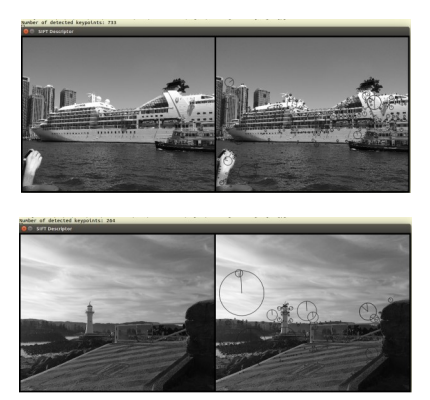
Figure 4. Keypoints from a cruiser ship image (top), and keypoints from a lighthouse image (bottom)